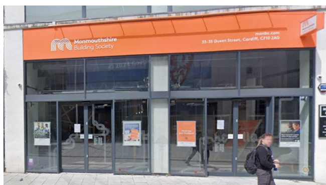
Monmouthshire Building Society

The Voices Group now meet regularly in the community